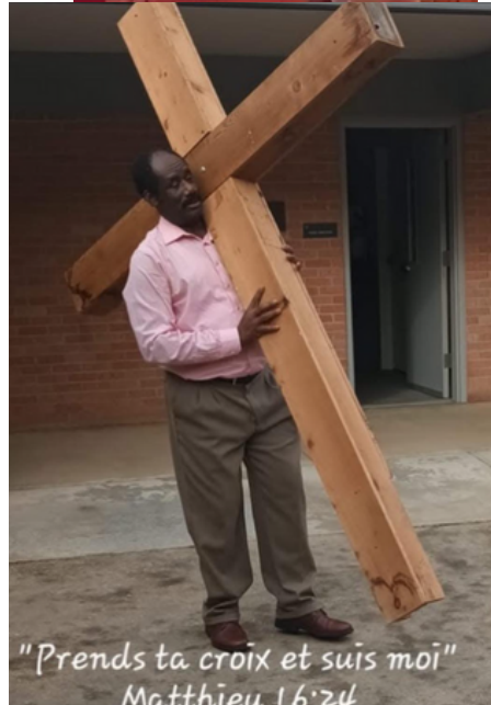
"Prends ta croix et suis moi" Matthieu 16:24