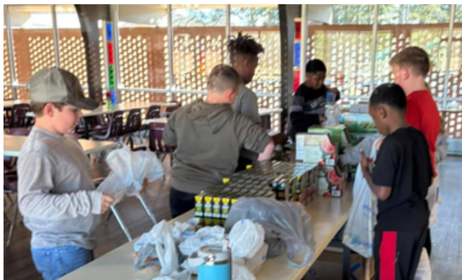
Kid's Club Kids help PIE by packing pantry items for Magnolia Schools.