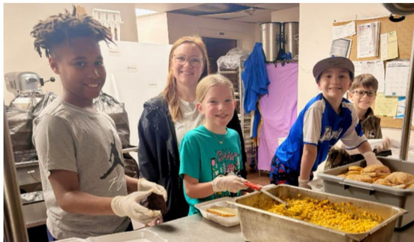
Kid's Club Kids serving at The Stewpot in March.