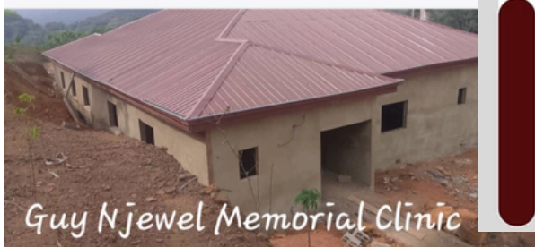
Guy Njewel Memorial Clinic